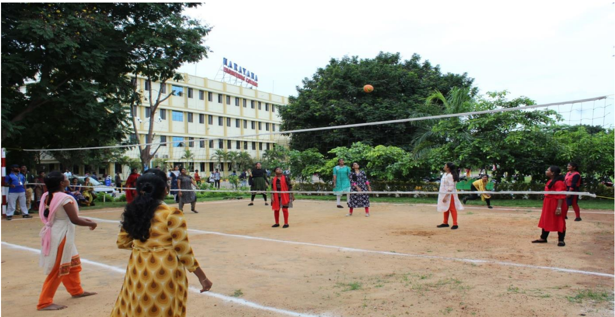
Throw ball Match