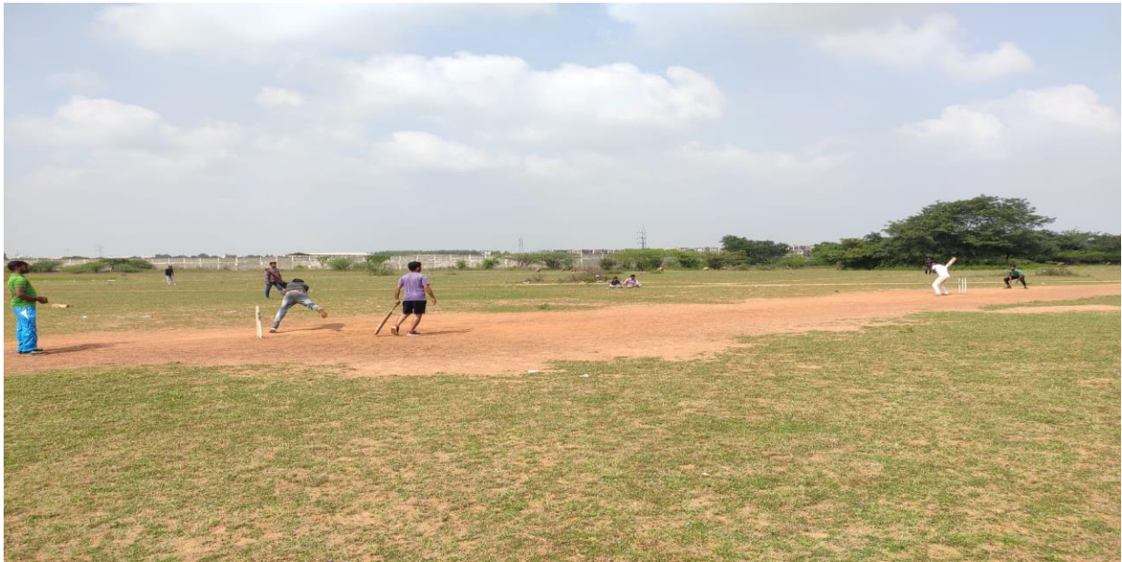
Cricket Final Match